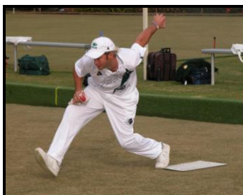
This bowler has just been asked to 'smack it'

Hit it, have a drive, have a run, smack it, rip him out, take it out, kill it – to have a forceful shot using maximum weight comfortable to the individual